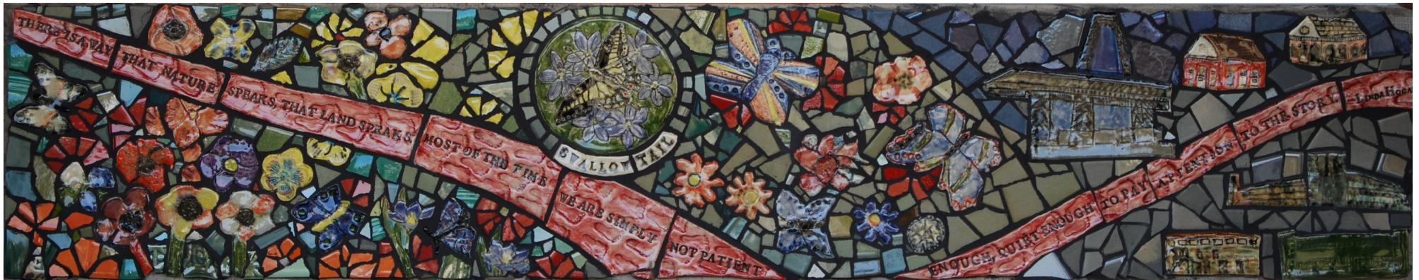
1.4—HUNTERS VIEW HILLSIDE: NATIVE FLORA AND FAUNA-HPS CRANE

THERE IS A WAY THAT NATURE SPEAKS, THAT LAND SPEAKS. MOST OF THE TIME WE ARE SIMPLY NOT PATIENT ENOUGH, QUIET ENOUGH, TO PAY ATTENTION TO THE STORY. —LINDA HOGAN