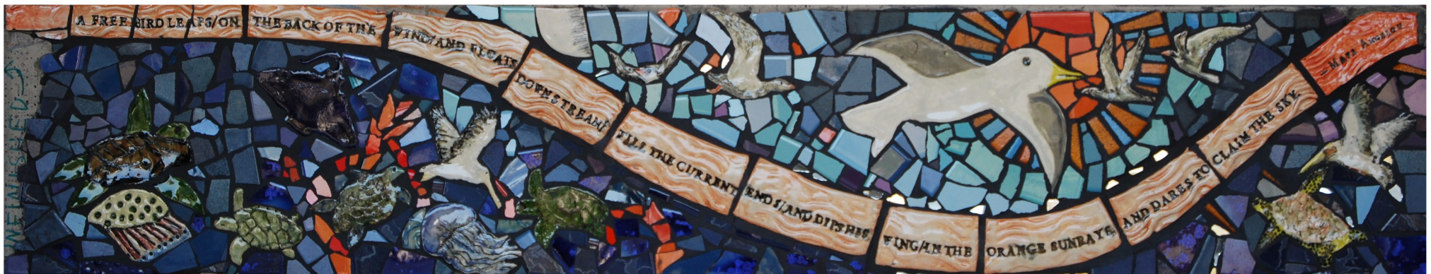
1.9—SEA BIRDS, TURTLES, JELLYFISH, RAYS

OUR ANCESTOR WAS AN ANIMAL WHICH BREATHED WATER, HAD A SWIM BLADDER, A GREAT SWIMMING TAIL ... HERE IS A PLEASANT GENEALOGY FOR MANKIND. —CHARLES DARWIN