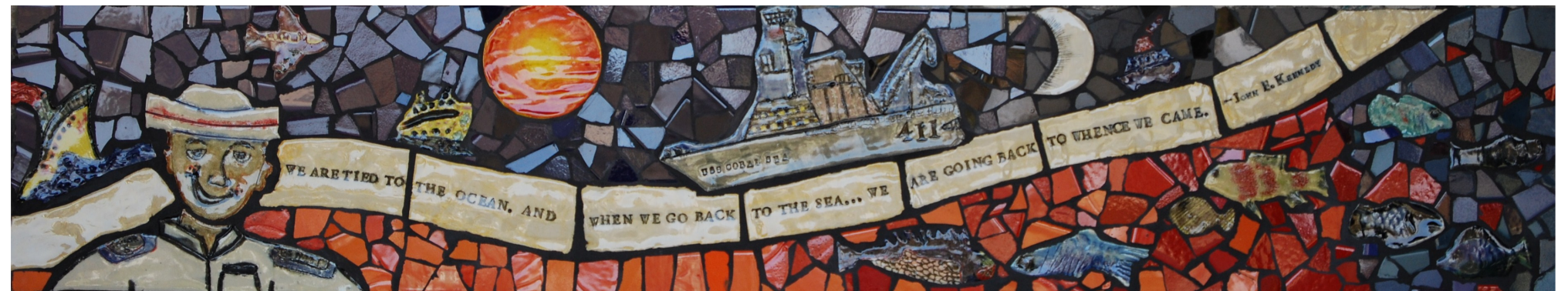
1.12—SHIPS-USS CORAL SEA, SAILOR

THE OWL AND THE PUSSY-CAT WENT TO SEA, IN A BEAUTIFUL PEA-GREEN BOAT. —EDWARD LEAR