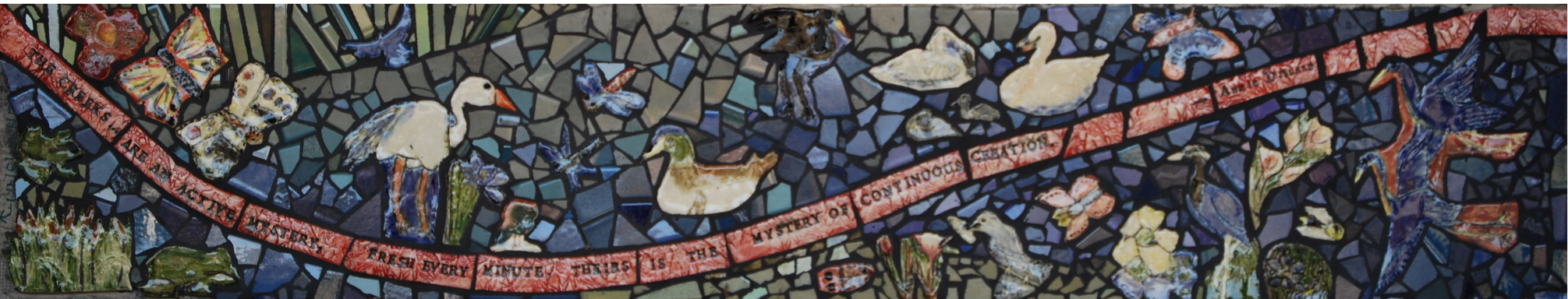
1.3—ISLAIS CREEK BED THE CREEKS ... ARE AN ACTIVE MYSTERY, FRESH EVERY MINUTE. THEIRS IS THE MYSTERY OF CONTINUOUS CREATION. —ANNIE DILLARD