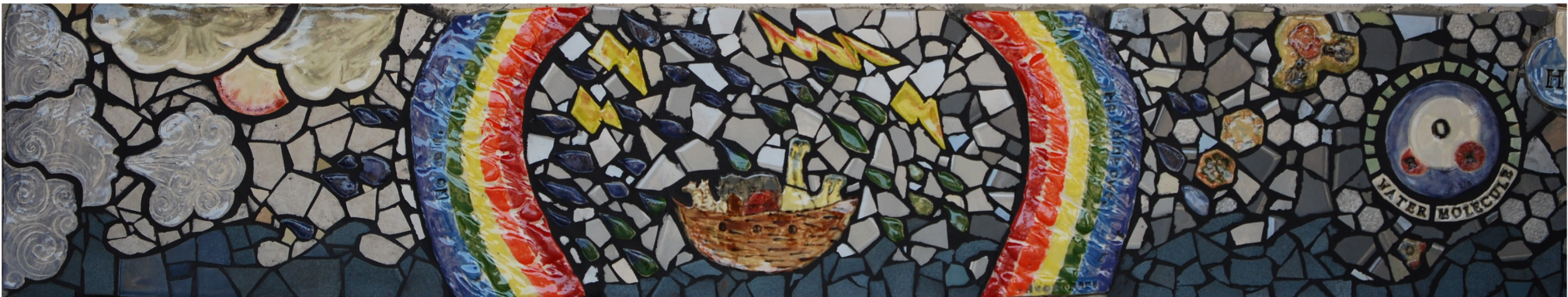
2.2 (PANEL 20) THE NORTH WIND, STORMS AT SEA, RAINBOWS, THE ARK, WATER MOLECULE

"IT IS FROM THE PROGENY OF THIS PARENT CELL THAT WE ALL TAKE OUR LOOKS; WE...SHARE GENES..., AND THE RESEMBLANCE OF THE ENZYMES OF GRASSES TO THOSE OF WHALES IS...A FAMILY RESEMBLANCE." —LEWIS THOMAS