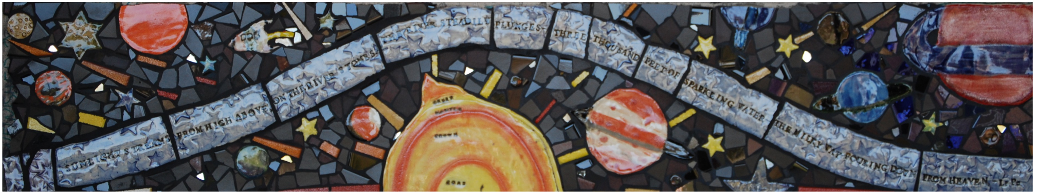
2.4 (PANEL 22) OUR SOLAR SYSTEM

SUNLIGHT STREAMS ON THE RIVER STONES. / FROM HIGH ABOVE, THE RIVER STEADILY PLUNGES— / THREE THOUSAND FEET OF SPARKLING WATER— / THE MILKY WAY POURING DOWN FROM HEAVEN. —LI PO