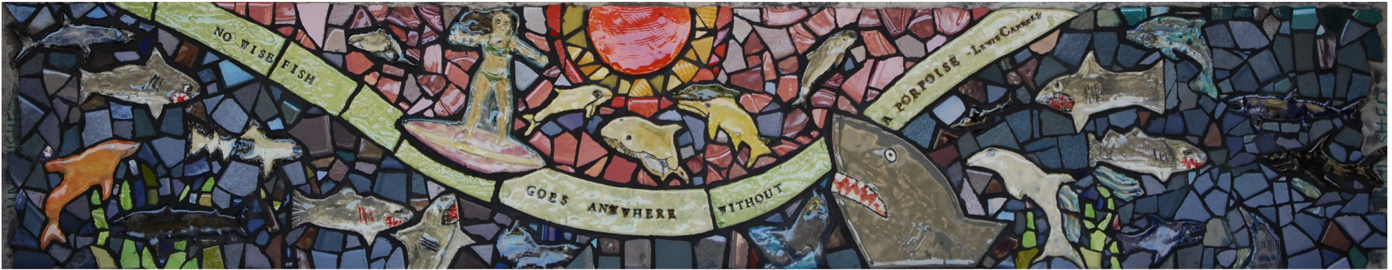
1.13—SHARKS “NO GOOD FISH GOES ANYWHERE WITHOUT A PORPOISE” –LEWIS CARROLL