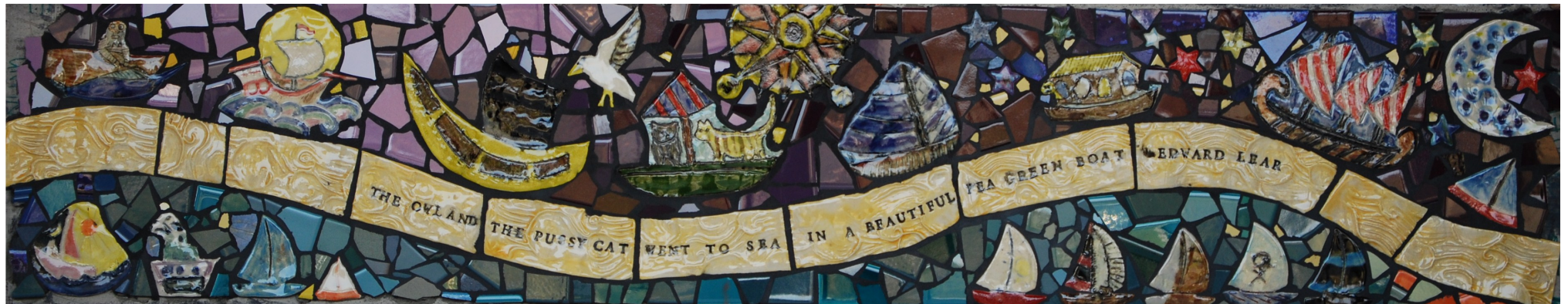
1.11—BOATS-FISHING, SAILING, CRUISING

“THERE SHE BLOWS! – THERE SHE BLOWS! A HUMP LIKE A SNOW HILL! IT IS MOBY DICK! —HERMAN MELVILLE