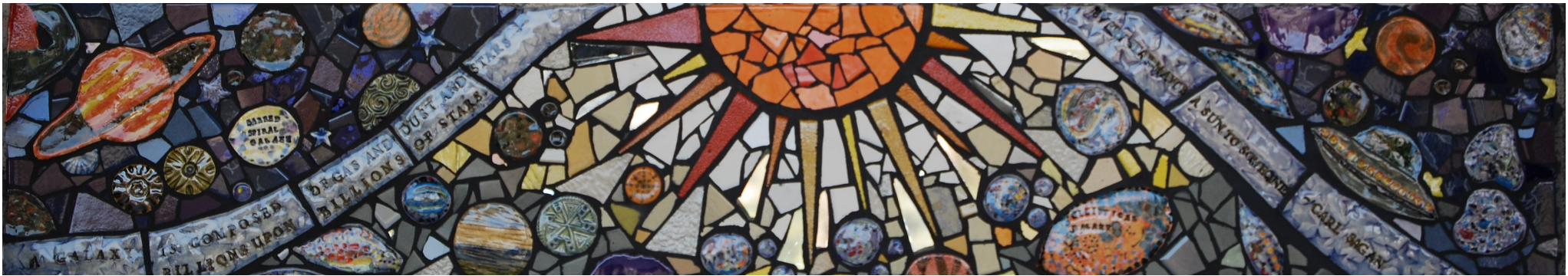
2.5 (PANEL 23) GALAXIES

SUNLIGHT STREAMS ON THE RIVER STONES. / FROM HIGH ABOVE, THE RIVER STEADILY PLUNGES— / THREE THOUSAND FEET OF SPARKLING WATER— / THE MILKY WAY POURING DOWN FROM HEAVEN. —LI PO