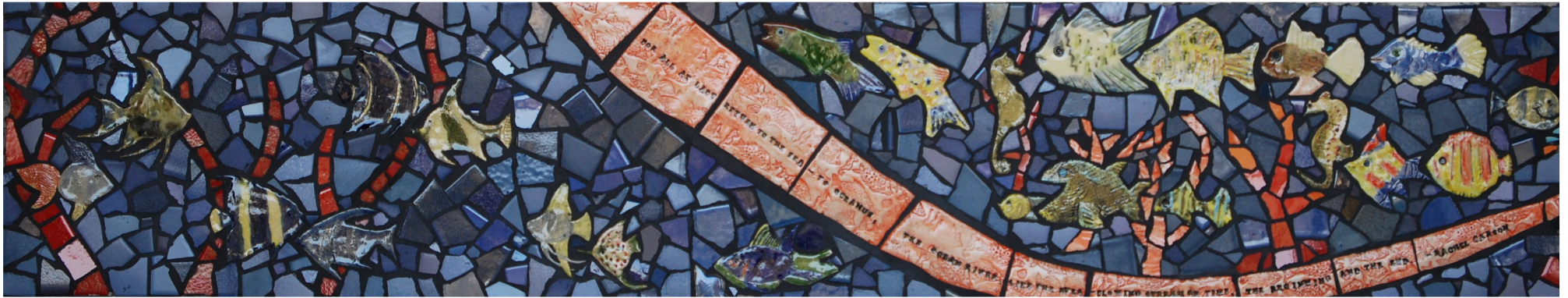
1.7—SEA PLANTS AND SMALL FISH

FOR ALL AT LAST RETURN TO THE SEA—TO OCEANUS, THE OCEAN RIVER, LIKE THE EVER-FLOWING STREAM OF TIME, THE BEGINNING AND THE END. —RACHEL CARSON