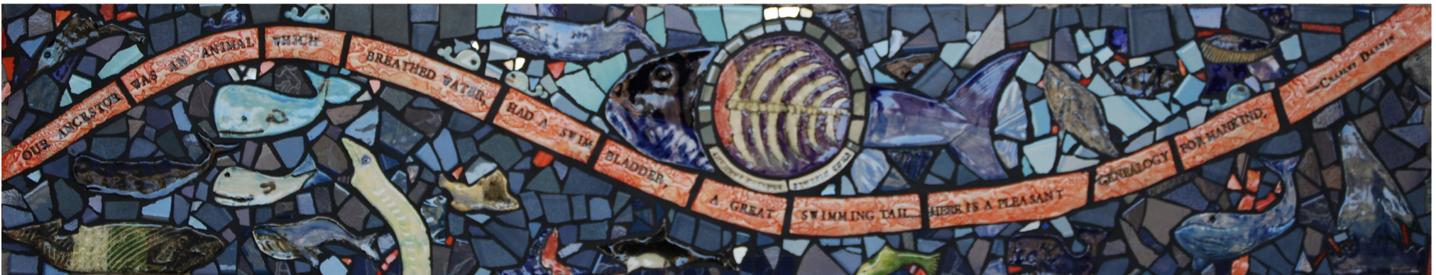
1.8—LARGE FISH: TUNA AND MARLIN; WHALES

FOR ALL AT LAST RETURN TO THE SEA—TO OCEANUS, THE OCEAN RIVER, LIKE THE EVER-FLOWING STREAM OF TIME, THE BEGINNING AND THE END. —RACHEL CARSON