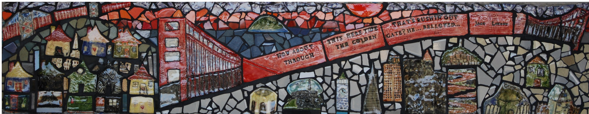
1.5—SF SHORELINE: CITYSCAPE WITH LANDMARK BUILDINGS, BAY AND GOLDEN GATE BRIDGES, YURBA BUENA AND ANGEL ISLANDS

THERE IS A WAY THAT NATURE SPEAKS, THAT LAND SPEAKS. MOST OF THE TIME WE ARE SIMPLY NOT PATIENT ENOUGH, QUIET ENOUGH, TO PAY ATTENTION TO THE STORY. —LINDA HOGAN