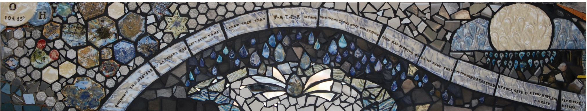
2.3 —(PANEL 21) STATES OF WATER-SOLID, LIQUID, VAPOR

... SOMEHOW THE MYSTERY OF LANGUAGE WAS REVEALED TO ME. I KNEW THEN THAT "W-A-T-E-R" MEANT THE WONDERFUL COOL SOMETHING THAT WAS FLOWING OVER MY HAND. THAT LIVING WORD AWAKENED MY SOUL, GAVE IT LIGHT, HOPE, JOY, SET IT FREE! —HELEN KELLER