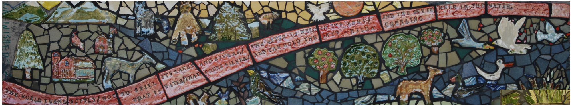
1.2—SIERRA SNOW MELT-CENTRAL VALLEY THE WORLD TURNS SOFTLY / NOT TO SPILL ITS LAKES AND RIVERS. / THE WATER IS HELD IN ITS ARMS / AND THE SKY IS HELD IN THE WATER. / WHAT IS WATER / THAT POURS SILVER, / AND CAN HOLD THE SKY? —HILDA CONKLING