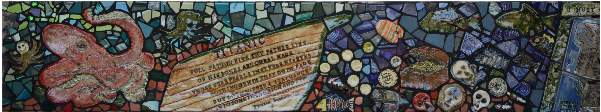
1.14—DEEP OCEAN: OCTOPUS, TITANIC SHIPWRECK, TREASURE, FULL FATHOM FIVE THY FATHER LIES; OF HIS BONES ARE CORAL MADE; THOSE ARE PEARLS THAT WERE HIS EYES: NOTHING OF HIM THAT DOTHS FADE. BUT DOTHS SUFFER A SEA-CHANGE INTO SOMETHING RICH AND STRANGE. —WILLIAM SHAKESPEARE