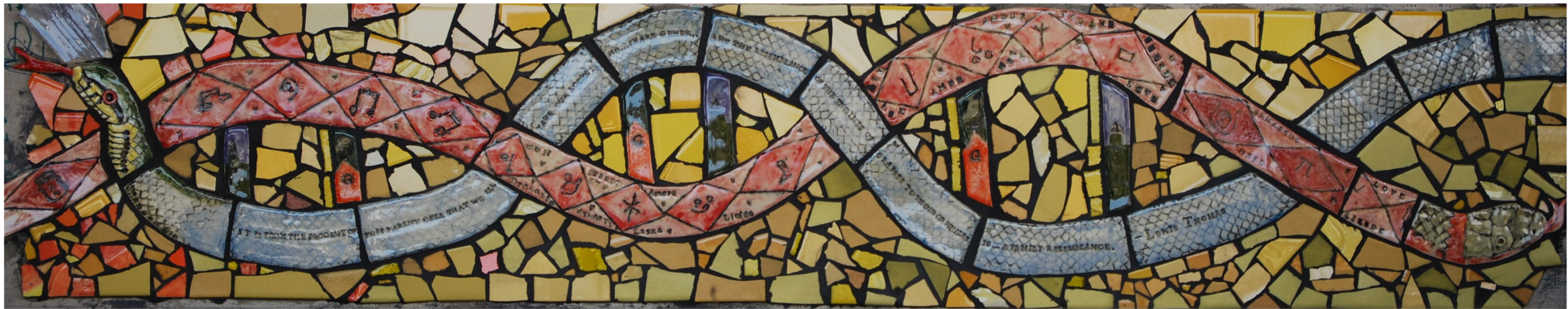
2.1 (PANEL 19) DNA STRANDS BECOME LIFE-GENETIC CODES-WORLD ALPHABETS

"IT IS FROM THE PROGENY OF THIS PARENT CELL THAT WE ALL TAKE OUR LOOKS; WE...SHARE GENES..., AND THE RESEMBLANCE OF THE ENZYMES OF GRASSES TO THOSE OF WHALES IS...A FAMILY RESEMBLANCE." —LEWIS THOMAS