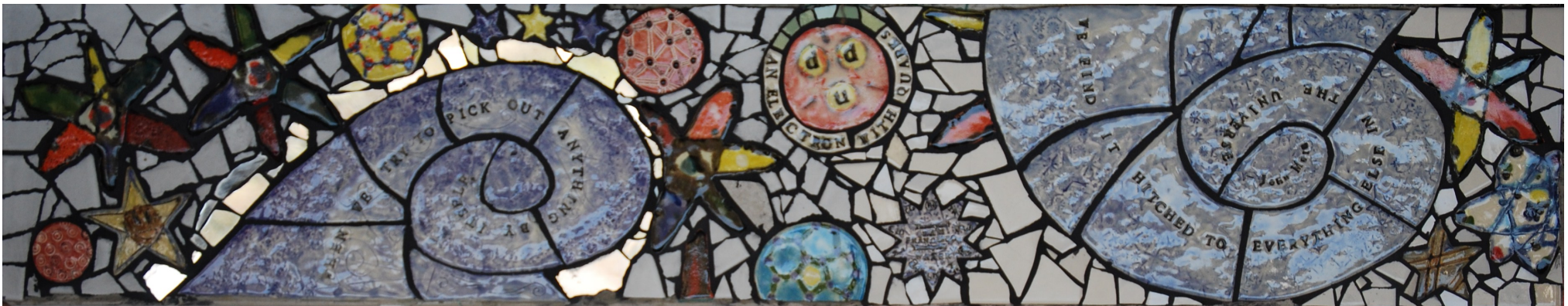
2.6 (PANEL 24) ATOMIC COMPOSITION/ THE ATOM: NEUTRONS, PROTRONS,ELECTRONS; SUBATOMIC PARTICLES: QUARKS

A GALAXY IS COMPOSED OF GAS AND DUST AND STARS—BILLIONS UPON BILLIONS OF STARS. EVERY STAR MAY BE A SUN TO SOMEONE. —CARL SAGAN