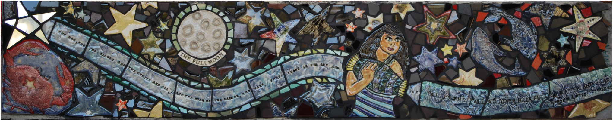
1.16—NIGHT SKIES-CONSTELLATIONS-ASTROLOGICAL FIGURES-CANCER, PICES, AQUARIUS

THE DOG, AND THE PLOUGH, AND THE HUNTER, AND ALL, / AND THE STAR OF THE SAILOR, AND MARS, / THESE SHONE IN THE SKY, AND THE PAIL BY THE WALL / WOULD BE HALF FULL OF WATER AND STARS. —ROBERT LOUIS STEVENSON