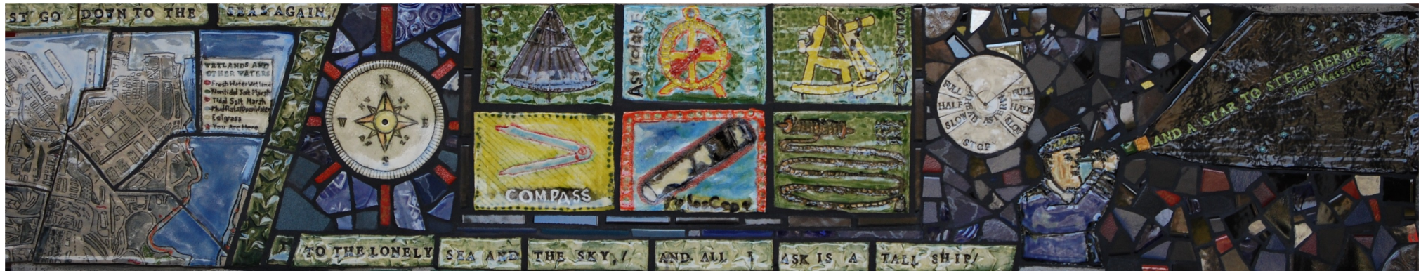
1.15—NAVIGATIONAL TOOLS-HUNTERS POINT SHIPYARD MAP-CAPTAIN WITH SEXTANT TO STARGAZE I MUST GO DOWN TO THE SEAS AGAIN, TO THE LONELY SEA AND THE SKY, / AND ALL I ASK IS A TALL SHIP AND A STAR TO STEER HER BY. –JOHN MASEFIELD