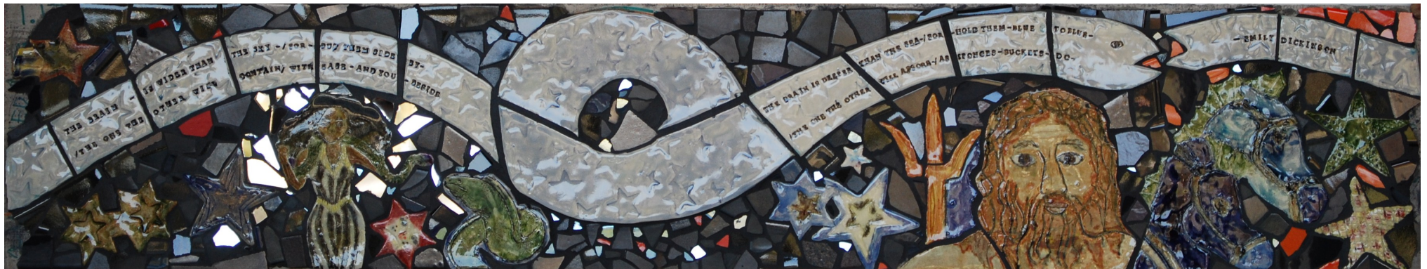
1.17—MYTHOLOGICAL CHARACTERS: YEMANYA, HYDRA, NEPTUNE

THE DOG, AND THE PLOUGH, AND THE HUNTER, AND ALL, / AND THE STAR OF THE SAILOR, AND MARS, / THESE SHONE IN THE SKY, AND THE PAIL BY THE WALL / WOULD BE HALF FULL OF WATER AND STARS. —ROBERT LOUIS STEVENSON