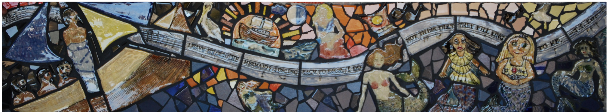
1.18—MYTHOLOGICAL BOOKS-HOMER'S ODYSSEY

...THE BRAIN IS DEEPER THAN THE SEA, FOR, HOLD THEM, BLUE TO BLUE, THE ONE THE OTHER WILL ABSORB, AS SPONGES, BUCKETS DO. —EMILY DICKINSON